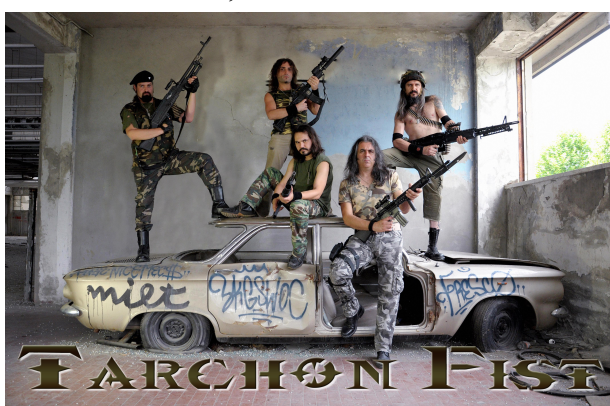
Tarchon Fist 2012

In 2012 the band, in addition to the work on the new album, went on performing on live stages: in