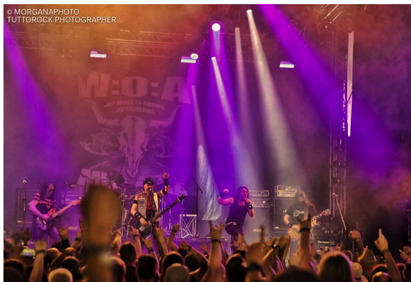
Tarchon Fist live at Wacken 2018

On March the 8 th 2019 Tarchon Fist announced by official online channels the upcoming release of the new concept album “Apocalypse” on August the 16 th under the german label “Pride & Joy”.