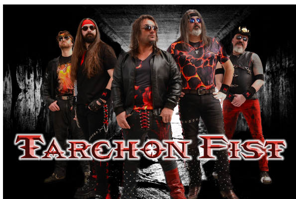
Tarchon Fist 2022

The band entrusts the promotion of the album to "NEE CEE AGENCY", that can boast a past collaboration with Nuclear Blast and, nowadays, is a reference for ATOMIC FIRE records. For the first time in his career, Tarchon Fist has entrusted the care of online channels to a professional social media manager for a semester.