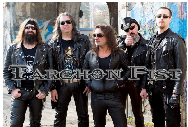
Tarchon Fist 2017