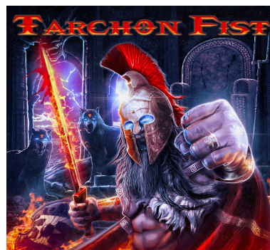
The Flame Still Burns