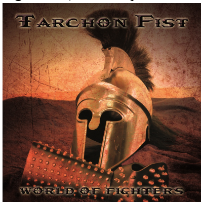
World Of Fighters LP

Figthers” (a title inspired to the first songs of side A “It’s my world” and side B “Fighters”).