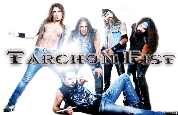
Tarchon Fist 2015

traditional European locations, played for the first time in Poland and Spain. In 2016 the historical German magazine "Rock Hard" published a compilation, enclosed to the magazine, including Opeth, Testament and other big bands, among which the Tarchon Fist.