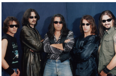
Tarchon Fist 2005