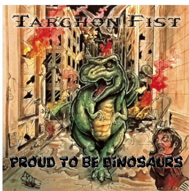
Proud To Be Dinosaurs

Tarchon Fist, even without drummer, started to work hard for 4 new tracks that would have been the preview of the new album. The idea was to create a full-length where all the tracks were linked together. The four songs mentioned formed an independent route which would be gathered in an EP. The idea to cut "Proud To Be Dinosaurs" was born.