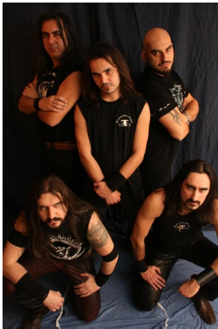
Tarchon Fist 2008