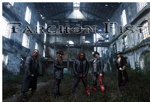
Tarchon Fist 2019

During the summer of 2020 a new lyric video for the song Sky Rider is released in comix style.